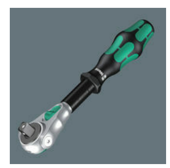
1. Fine-tooth ratchet 2. Flex-head ratchet 3. Angle ratchet 4. Quick-release ratchet 5. Power ratchet 6. Screwdriver