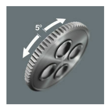
The reversible ratchet with 72 finepitched teeth has a low return angle of only 5°. This short stroke allows fast and precise work in all types of installation.